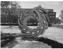
21. Spiraal II , 1982. Piet Killaars.