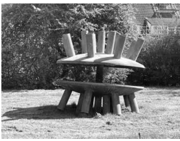
24. Forgotten work , likely by Jan van Munster (relocated from another site; now hidden behind a school fence).