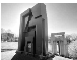
31. Sjatoodoo , 1989. Kees Verschuren.