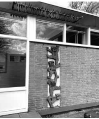
9. Klimfiguren , 1963 (with anti-climb spikes above to prevent children from using it as a climbing frame). Julia Braendle.