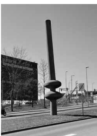
29. De dobber , 1966 (Jan with vertical balls). Red. Gust Romijn.