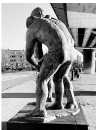
47. Dijkwerkers , 1970. Ek van Zanten.