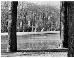
18. Quill , 1973. Phillip King.