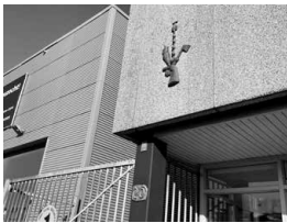
2. Bronze façade piece from Visser's installation company, established in 1921. Metalworking tools cast in bronze. Artist unknown.