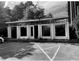
1. Hang Out , 2003. Replica of the façade of the adjacent B.a.d building. Made by Kamiel Verschuren.