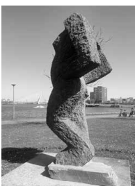
56. Vrouw II , 1990. Kees Buckens.