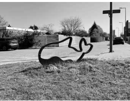
8. Little whale . Artist unknown.