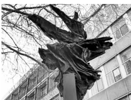
39. Untitled , 1967. Francesco Somaini (like metal shards from the bombing).