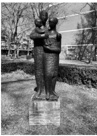
15. Het gezin , 1963 (as it was supposed to be in those days, on the church steps). Huib Noorlander.