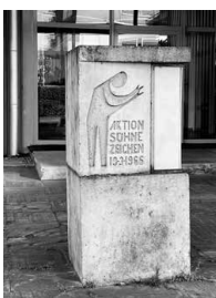
35. Aktion Sühnezeichen , 1966. Reparation gift (ecumenical building by Rietveld, Van Dillen, Van Tricht).