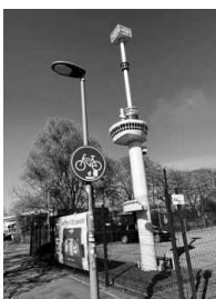
27. Miniature Euromast on the pavement in front of waste management company Renewi.