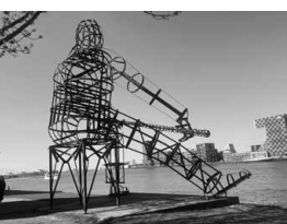
57. De visser , 2006 (steel piece rendered unfit as a climbing frame). Ger Bout.