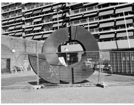
20. Twee cirkelsegmenten , 1978. Leen Droppert (the wall relief is also part of it, but will soon be demolished).