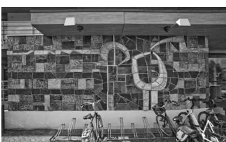
32. Untitled , 1961, façade object. Henk Mooij.