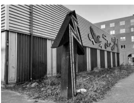
45. Untitled , 1973 (arrow). Marianne Groen.