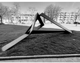
16. Op weg zijn, ontmoeten , 1991. Ton Koops.