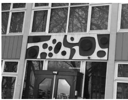
14. Bescherming , 1962 (relief on the former police station façade). Gust Romijn.