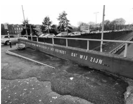
53. Maastunnel monument voor verkeersslachtoffers NL ( Maastunnel Monument for Road Traffic Victims NL ), 2003 ("[...] that we are"). Kamiel Verschuren.