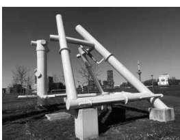
55. Welland , 2023 (reused pontoon parts). Ruud Kuijer.