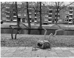
11. Dolphins . Artist unknown.