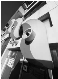
5. Untitled , 1977 (flames on what used to be a fire station). Leen Droppert.