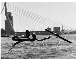
40. Maas Sculpture , 1982 (hanging from Willems Bridge). Auke de Vries.