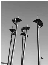
43. Plein Loods 24 , 1999. Pieter Figdor, Atelier Quadrat.