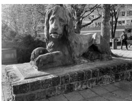
38. Vier leeuwen , 1778 (now only three remain, and they've been moved multiple times). Johannes Keerbergen.