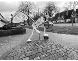
25. Unknown neighborhood sculpture featuring a ship's telegraph as a head.