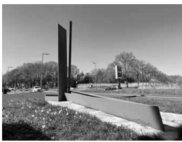
13. Untitled , 1990. Red. Rik Blom.