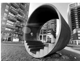
46. Astana , 2021 (circle to sit in). Studio Wieki Somers.