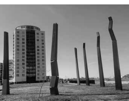
58. Obelisk , 1989 (first there were four, then six). Jan Ijzendoorn.