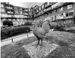
37. Unknown (iron rooster).