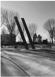
4. Twee kolommen , 1977. Gust Romijn. Red. Restored and relocated.