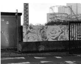
52. Rozenwand , 1996 (the remains of it, near what used to be the municipal waste company). Lydia Schouten.