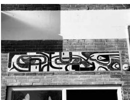
36. Unknown , 1965. Tile tableau.