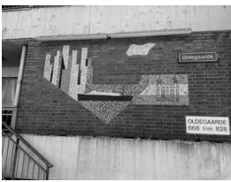
12. Harbor city mosaic . Artist unknown.